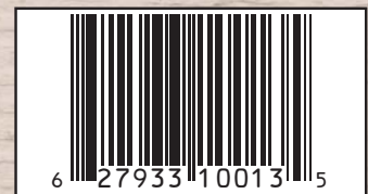
Calcium 204 g Powder